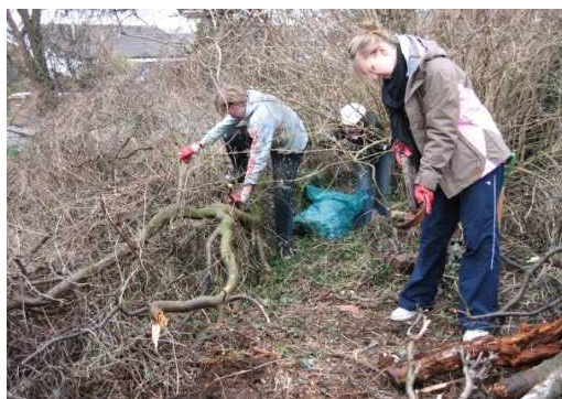
Clearing a derelict area on the Wirral

Lets work together at bringing hope to our city.