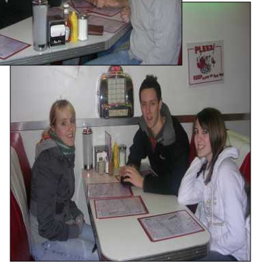
Some of the eq young people for 2008